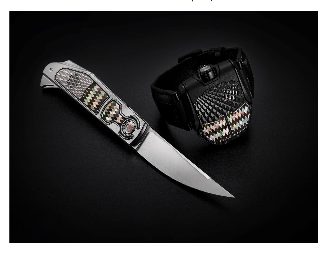
The UR-T8 "Colibri and its T8 "Colibri" art knife – each a unique object.

The watch is paired with its art knife. The Colibri T-8 model is a customized folding knife. Its handle frame in 416 stainless steel encases a blade mechanism, which runs on ceramic ball bearings. The knife's handle, lock button and blade spine feature black lip mother of pearl mosaic inlays, designed with an alternating light technique, which creates a distinctive chromatic effect. Every piece of pearl is connected by individual 18k gold pins, and each mosaic inlay is outlined with a black vintage Bakelite frame. The diamond patterned mosaic inlay is paired with a titanium insert, 3-D sculpted with the same pattern as the URWERK T8 case. Additionally, the shape of the patented C-Lock mechanism, which locks the blade in both the open and closed positions, has been redesigned to resemble the outline of the URWERK T8 case. A very special attribute of this knife is the inclusion of a sapphire glass window which displays a kinetic internal turbine, similar to the working turbine in an Urwerk watch mechanism."